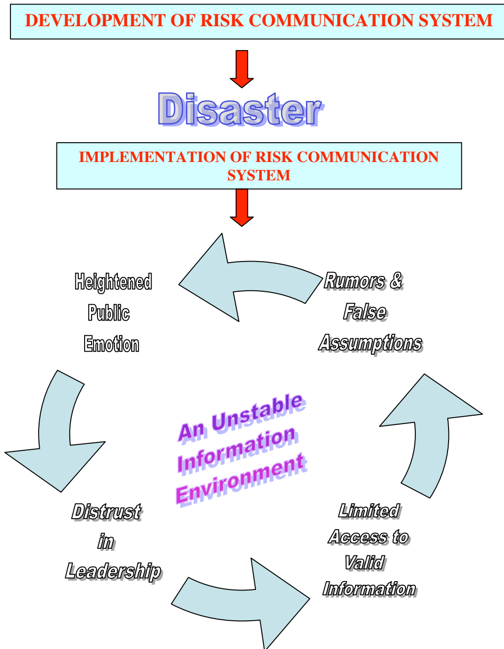
Figure 1: The Role of Disaster Risk Communication Systems

Latinos in Baltimore, Maryland where 53% were “not too confident” or “not at all confident” and 32% were “confident” of fair treatment (Rowel, Zapata & Allen, 2009). In