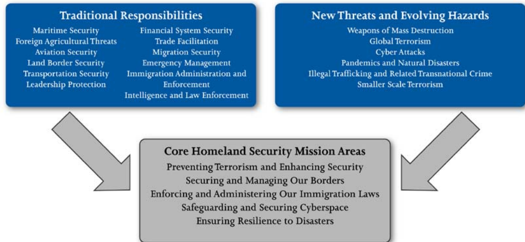
Figure 1. The Evolution of Homeland Security

As noted earlier, although the integrated concept of homeland security arose at the turn of the 21 st century, homeland security traces its roots to concepts that originated with the founding of the Republic. Homeland security describes the intersection of new threats and evolving hazards with traditional governmental and civic responsibilities for civil defense, emergency response, customs, border control, law enforcement, and immigration. Homeland security draws on the rich history, proud traditions, and lessons learned from these historical functions to fulfill new responsibilities that require the engagement of the entire homeland security enterprise and multiple Federal departments and agencies.